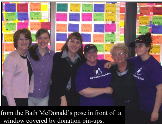
Staff from the Bath McDonald's pose in front of a window covered by donation pin-ups.

In April the Old Navy store in Brunswick hosted a lemonade stand fundraiser. Bigs and Littles volunteered at the stand to greet shoppers and serve lemonade in return for donations. This fundraiser was coordinated by volunteer Big Sister Shawn McMullen!